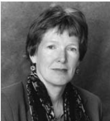
Margaret MacMillan

armed with pledges of national self-determination and selfless diplomacy wrapped in his Fourteen Principles. Thanks to Woodrow Wilson, millions around the world awaited to have their dreams come true. Hundreds of them came to Paris, confident that Wilson would believe their good, bad, terrible and always special cases. The combination helped redraw the world's borders and murdered several millions.