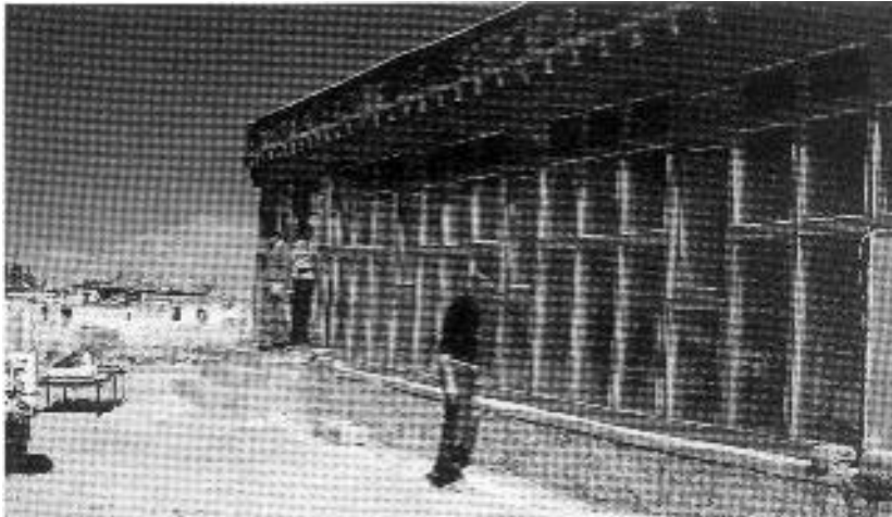
Trombe wall in residence at Leh, Ladakh.

New, there were no authentic early examples of well-constructed centrally heated buildings. The archetypal Red Indian dwellings in the USA and the domestic buildings in Europe incorporated nothing more than a fireplace.