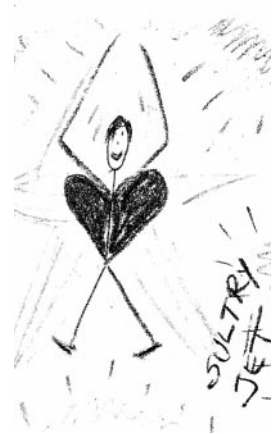
Figure 1. This is me (points). The sultry jet. I don't remember much about growing up except one time I was dancing as the Jet—it was anti-feminine. Black leather.

Not only did she eloquently describe her own experience in words, but she also drew pictures which conveyed a strong sense of the experience. The following are images from her, and from other group members, which give a sense of the group process and the creation of healing images and rituals (see Figures 1, 2 and 3).