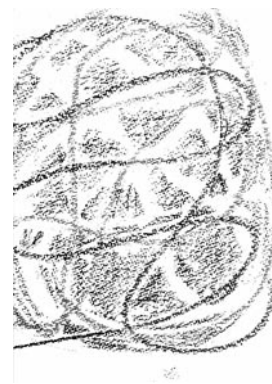
Figure 2. It was incredible being in the circle. I felt the energy. I have strong faith in all of us healing each other. It was exquisite; thank you everyone. Fire in these bones struggling to become free to stay free. Move lady move. I have to remember to breathe and move.

During the course of our groups, we noticed some