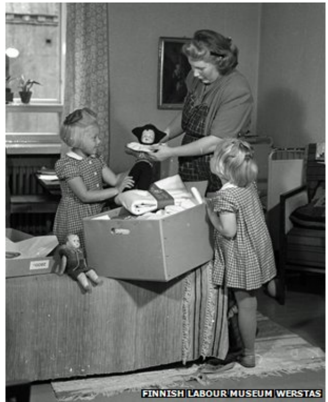
A 1947 maternity pack