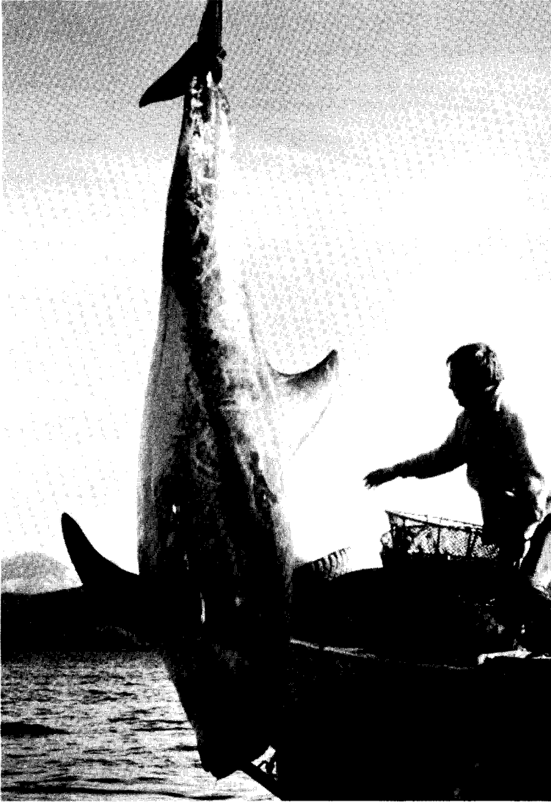
FIGURE 1. Risso's Dolphin from the Queen Charlotte Islands. This animal live-stranded and died.

Africa (Barnard 1954). In the Pacific they are found as far north as the Gulf of Alaska (Braham 1983) and the Kurile Islands (Leatherwood and Reeves 1983), and as far south as central Chile (Aguayo 1975). They are distributed throughout the Indian Ocean (Kruse et al. in press ) and are thought to be present throughout the Indo-Pacific area, occurring as far south as New Zealand and Australia (Mitchell 1975a). No information is